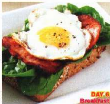
DAY 6 Breakfast

LUNCH Chicken & Alfalfa Sandwich. 2 slices dark rye bread (3). Top with 2 tsp seeded mustard (0), 1 tbsp Weight Watchers Cottage Cheese (½), 30g Weight Watchers Chicken