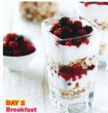
DAY 2 Breakfast

LUNCH Pasta with Fresh Tomato, Olives & Ricotta. 50g fresh pasta (2½) cooked. Combine with 1 vine-ripened tomato (0), finely chopped, 1 tsp baby capers (0), ¼ red onion (0), finely sliced, 1 tsp olive oil (1), ½ cup fresh basil leaves (0), shredded, 1 cup rocket (0), chopped, 50g low-fat ricotta (½), crumbled, 12 pitted