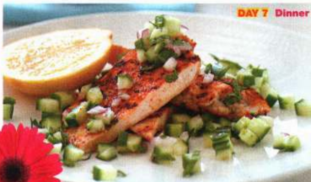
DAY 7 Dinner

SNACKS/TREATS ● 1 apricot (½) ● 1 mini Mango and Cream Weiss Bar (1) ● ½ cup cherries (1) ● 5 rice crackers (½) with 1 tbsp tomato salsa (0) POINTS VALUE: 3