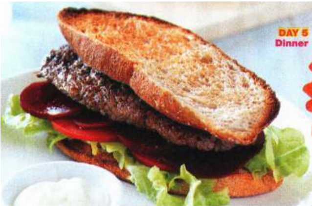
DAY 5 Dinner